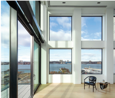
CWR - Penthouse