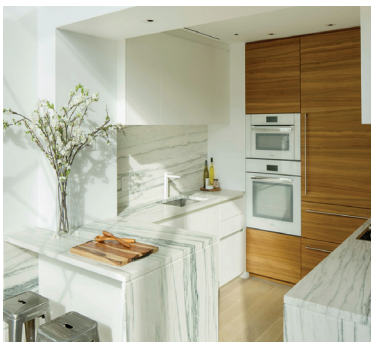
CWR - Duplex Kitchen