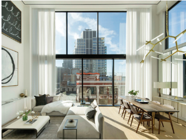
CWR - Duplex Great Room