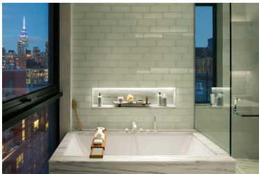
CWR - Master Bath